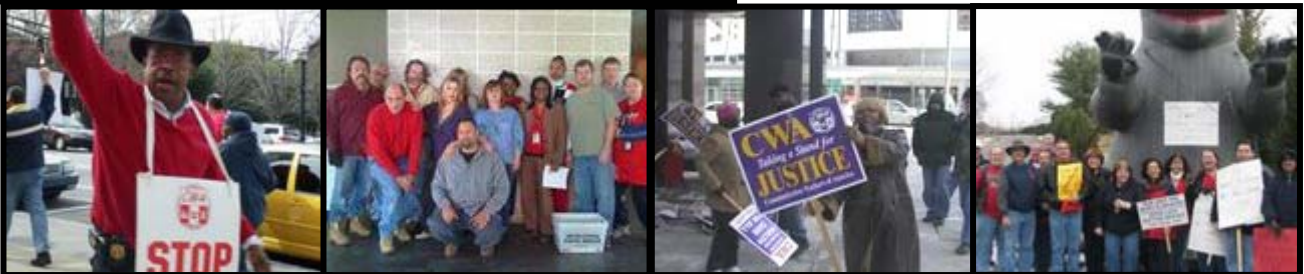
Mobilization in Atlanta; Middletown, NJ; Detroit; and Drainsville, VA

In other words, management wants complete freedom to do whatever it wants, whenever it wants. This proposal is just one more way that AT&T disrespects our work, our contracts, and our Union.