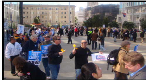
Members of locals 9410, 9412, 9415, 9404, 9119, and 9417 stood up for Employee Free Choice in San Francisco and Stockton.

Local 6203 in Lubbock has included the Employee Free Choice Act in education for members, telling them, “We must level the playing field.”